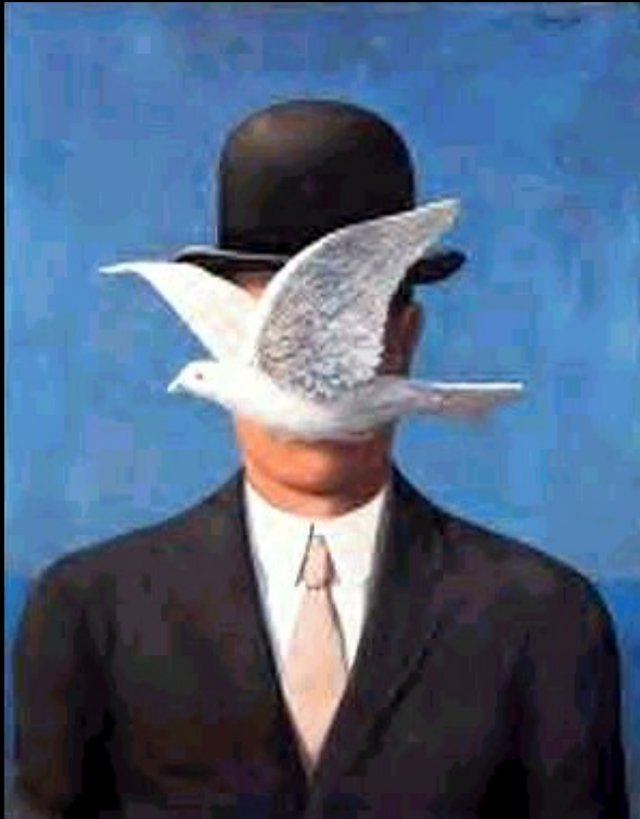
“L'Homme au Chapeau Melon”